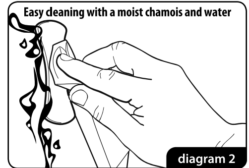
Easy cleaning with a moist chamois and water

For quick cleaning, use a damp, lint-free wipe or cloth (i.e. chamois) to remove dust, dirt and oil from Clingo pad or simply rinse with water and let it air dry ( diagram 2 ). DO NOT use any paper products to wash or dry your Clingo product.